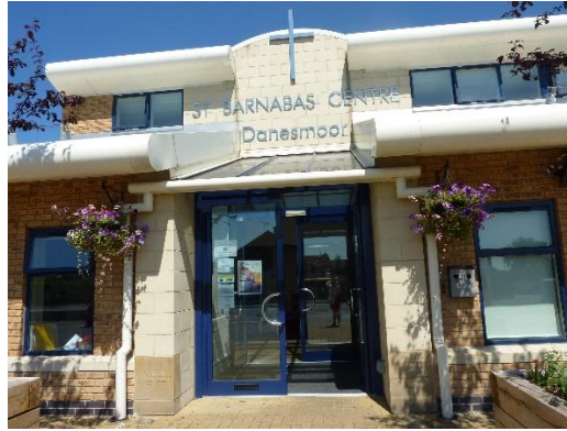
Figure 7 St. Barnabas Centre