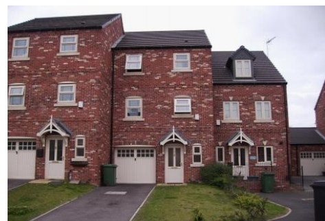
Figure 8 Curate's House

Is a modern 3 storey town house with 4 bedrooms close to St. Barnabas Centre in Danesmoor.