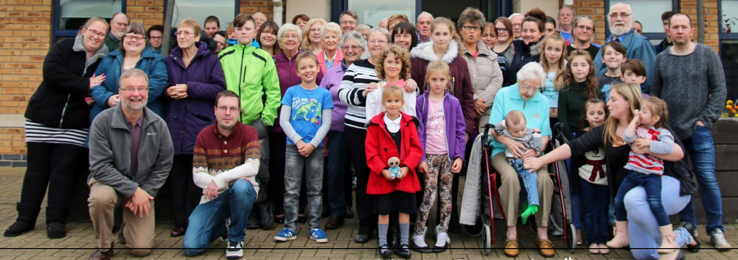
Community users and Congregation celebrating the Centre's 10 th Anniversary

Available in the North Wingfield Team Ministry, Derby Diocese