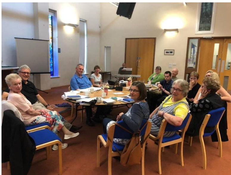
Figure 2 Congregation

The task of the curate, after an initial settling in period, will be to lead and develop this group of people who are ready to progress into the next phase of deeply contextual outreach to the largest social housing estate in Derby Diocese.